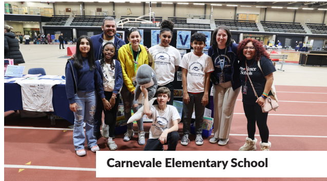
Carnevale Elementary School