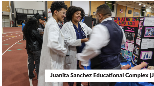
Juanita Sanchez Educational Complex (JSEC)

A big thank you to everyone who came out for the School Choice Fair ! We were very excited to see our families and to share information about school options for next year! Our schools came out in full force to show our families what they have to offer for students. Thank you to everyone who made this night possible!